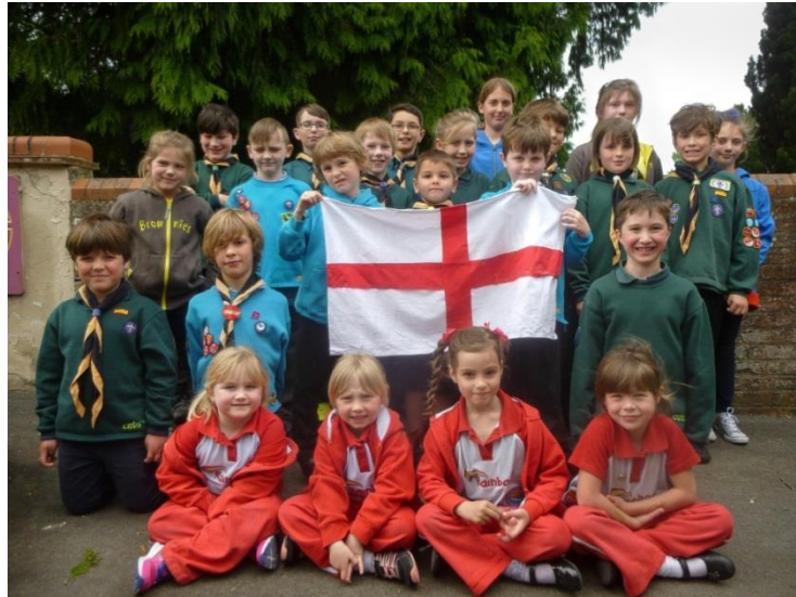
St George's Day at Durweston